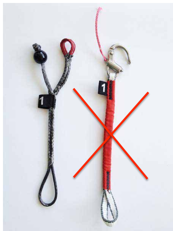
Left: the new CRS part 1 Right: previous CRS part 1