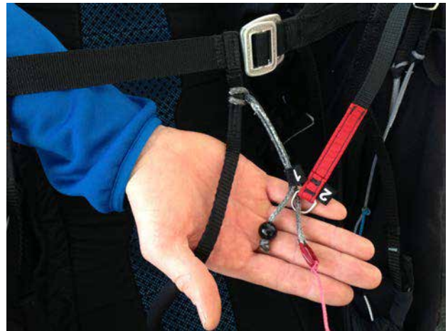
2 Closing: red loop goes through rings (2) and (3), then over the ball