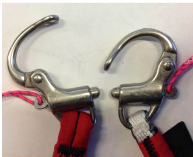
Left: good quality pin Right: end too rounded