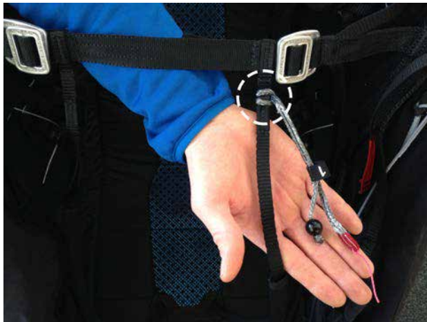
1 Fit the new part with an anchor hitch